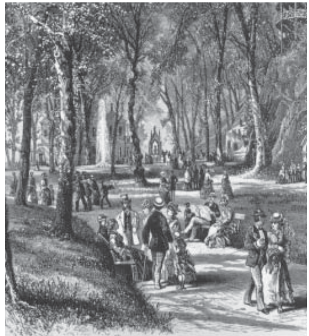
The South Garden in the 1870s. Fairmount Water Works

Rodin Museum, Philadelphia, PA. Paving restoration involving importing specially dimensioned limestone from France, new sympathetic materials, and protection for "The Thinker."