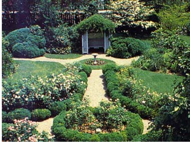
1820s Rose Garden Wyck, Philadelphia

Wyck, Germantown, PA. A 2-acre remnant parcel and house dating from the 1600s, with the house renovated by William Strickland in the 1820s. Landscape features included the oldest documented continuously maintained rose garden in the United States, numerous historic outbuildings and mature plants. The Garden Committee played a pivotal role in refining the: