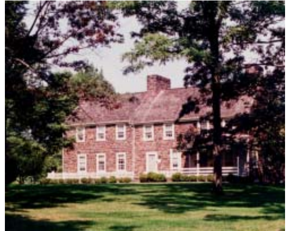
Peachfield Plantation, Mt. Holly

White Farm, Princeton, NJ. An historic farmstead site containing the event which led to the Battle of Princeton.