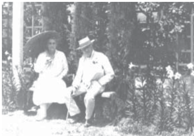
Thomas and Mina Edison in the Moonlight Garden, Fort Myers.