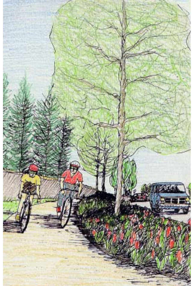
Route 141 passing the historic DuPont Nemours, Delaware

Route 141, Delaware. Mitigation for major road improvements near the Hagley Museum, Nemours, and other culturally sensitive areas.