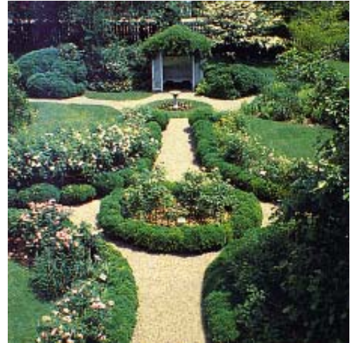
1820s Rose Garden at Wyck

Lemon Hill, Philadelphia, PA . Restoration report and plan for the area immediately surrounding this significant 1800 manor house incorporating a 1920s Fiske Kimball landscape design in Fairmount Park.