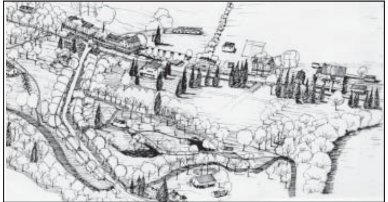
Yellow Springs South Meadow Master Plan

Fairmount Water Works, Philadelphia, PA. $23M restoration of the National Landmark 1840s-70s South Garden and 1920s Italian Circle with parking and accessible site improvements.