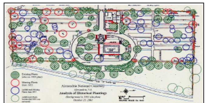
Alexandria National Historic Cemetery, Virginia