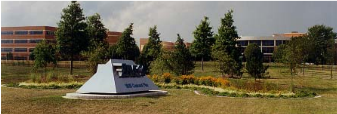
Astrazeneca's Former Main Entrance